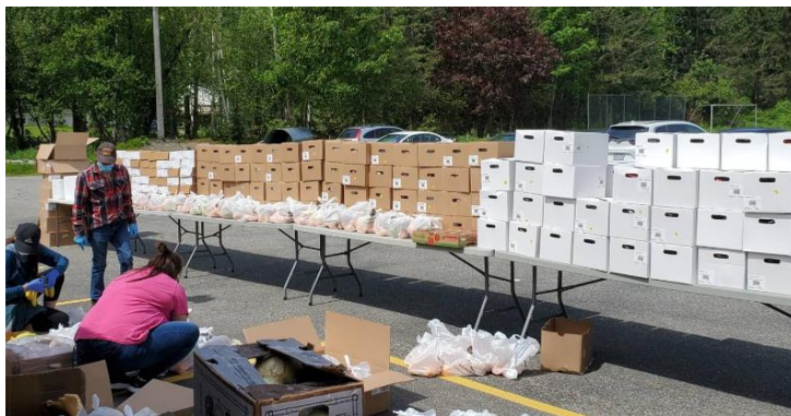
Pictured Above: SFN Food Drive-thru on Reserve May 5 th