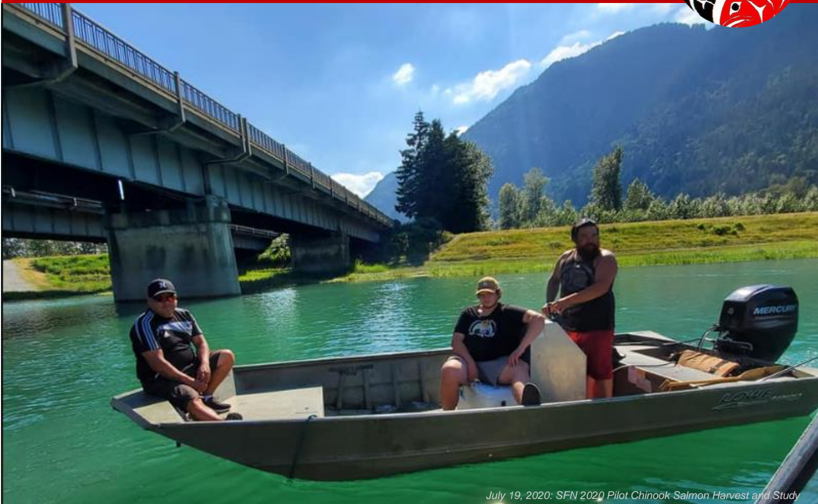
July 19, 2020: SFN 2020 Pilot Chinook Salmon Harvest and Study