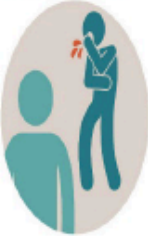
No close contact.

The Sumas Covid Vaccination Clinic was March 2 nd , 2021 at the Longhouse we had a great turn out with a cultural drumming ceremony and cultural workers on site so members could be brushed off if they wanted after their appointments. The clinic went very smoothly and a big thank you to all those that helped make this happen for the community! We will be planning our second dose clinic for around 16 weeks later for those that received the first dose of the Pfizer vaccine on March 2 nd , 2021.