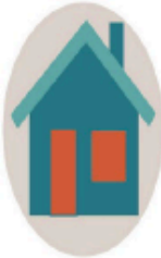
Stay home if sick.