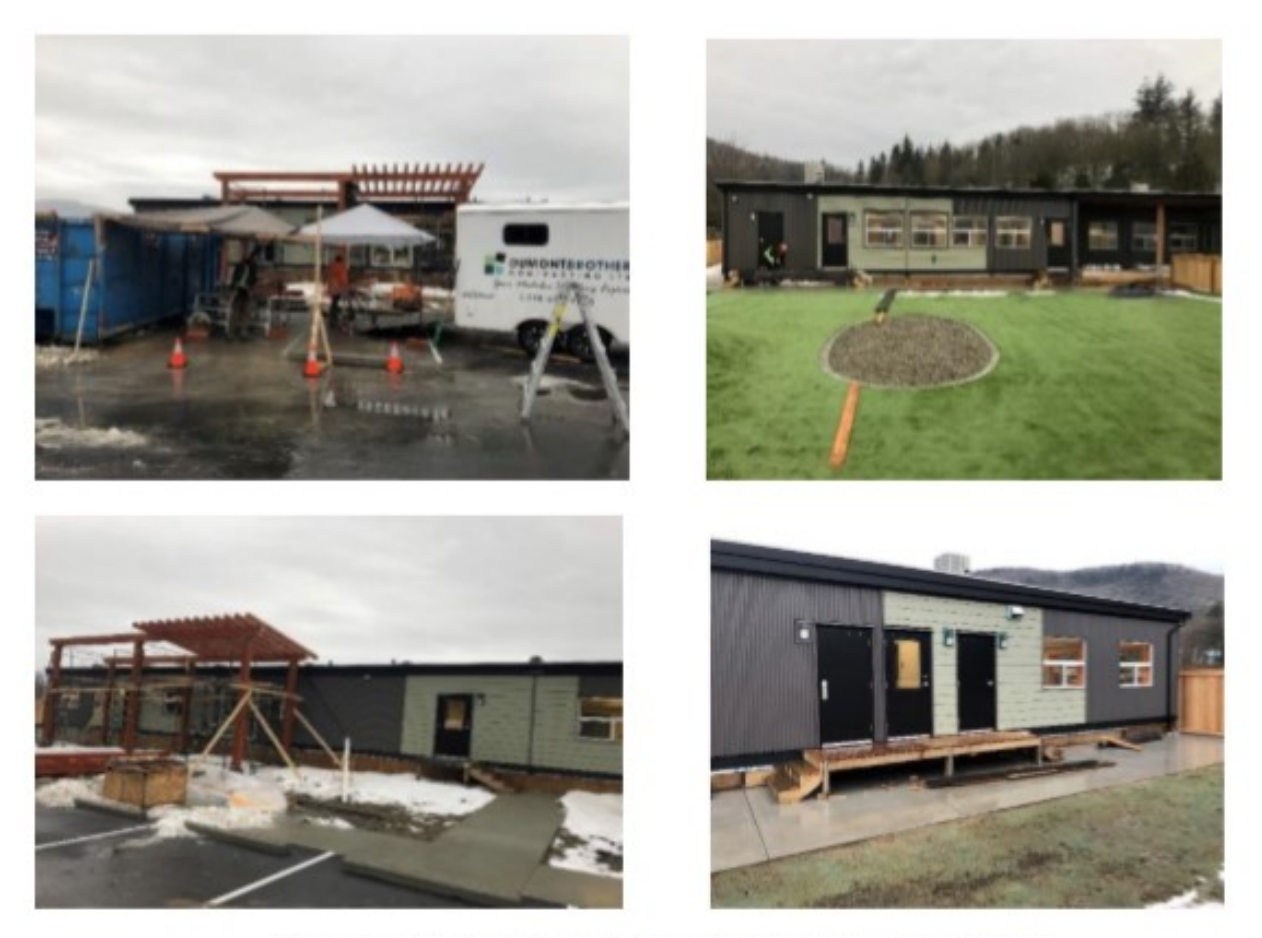
Community Led Development and Planning Grant

Busy Bear has been granted funding for Community -Led Development and Planning. The intention for this grant is to engage communities to imagine a better future for young children and their families and support them to create an action plan to achieve their vision. We have used a portion of the funding to send out a survey to families in the community as well as coordinating a Drum Making workshop.