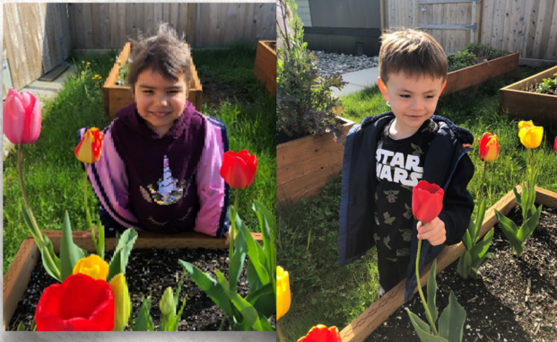
"This is the tulip I planted"

We are excited to have our Elders coming to visit us in May, and June. They will be sharing their cultural knowledge with the children and staff.