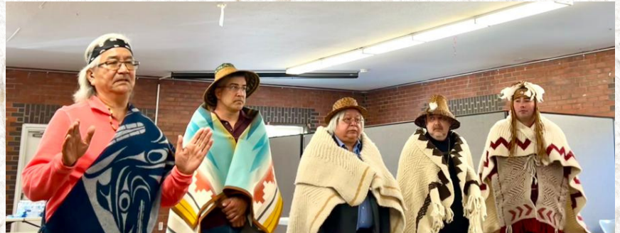
Chief Point leading the Ceremony with blessings for Chief and Council.