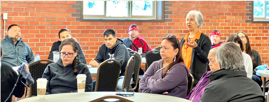
Community Members sharing their wisdom and well wishes for Chief and Council.